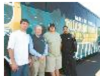
April's best (6 photos)