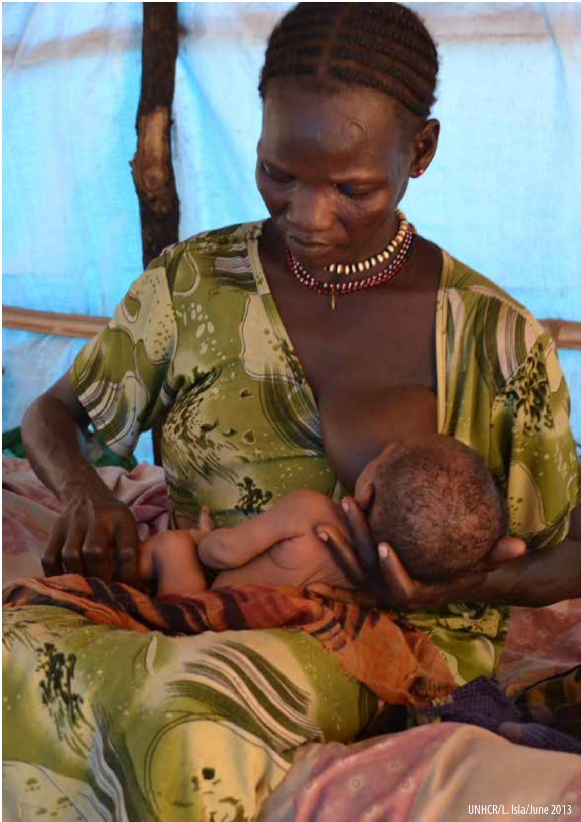
UNHCR/L. Isla/June 2013

In some situations where BMS is in demand, extra controls may be needed to prevent leakage and protect the security of staff. See Case Study 8 for an example of this. Marking or altering the package to reduce the likelihood of resale can also be used to reduce the sale of BMS on the market.