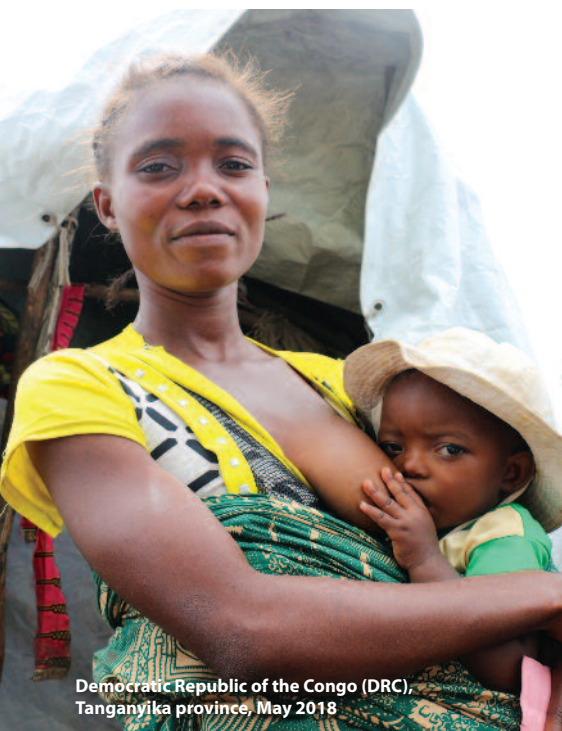
Democratic Republic of the Congo (DRC), Tanganyika province, May 2018