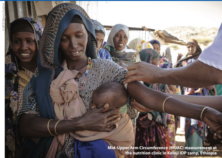
Mid-Upper Arm Circumference (MUAC) measurement at the nutrition clinic in Koloji IDP camp, Ethiopia

The CMAM Surge approach is one of many ongoing efforts to improve the efficiency and effectiveness of treatment services for wasting during both normal and emergency periods (Kueter et al. ,