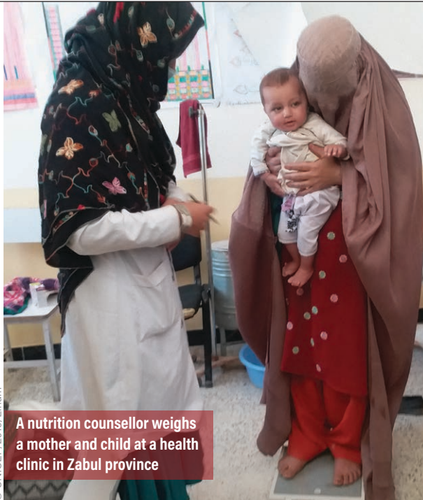
A nutrition counsellor weighs a mother and child at a health clinic in Zabul province