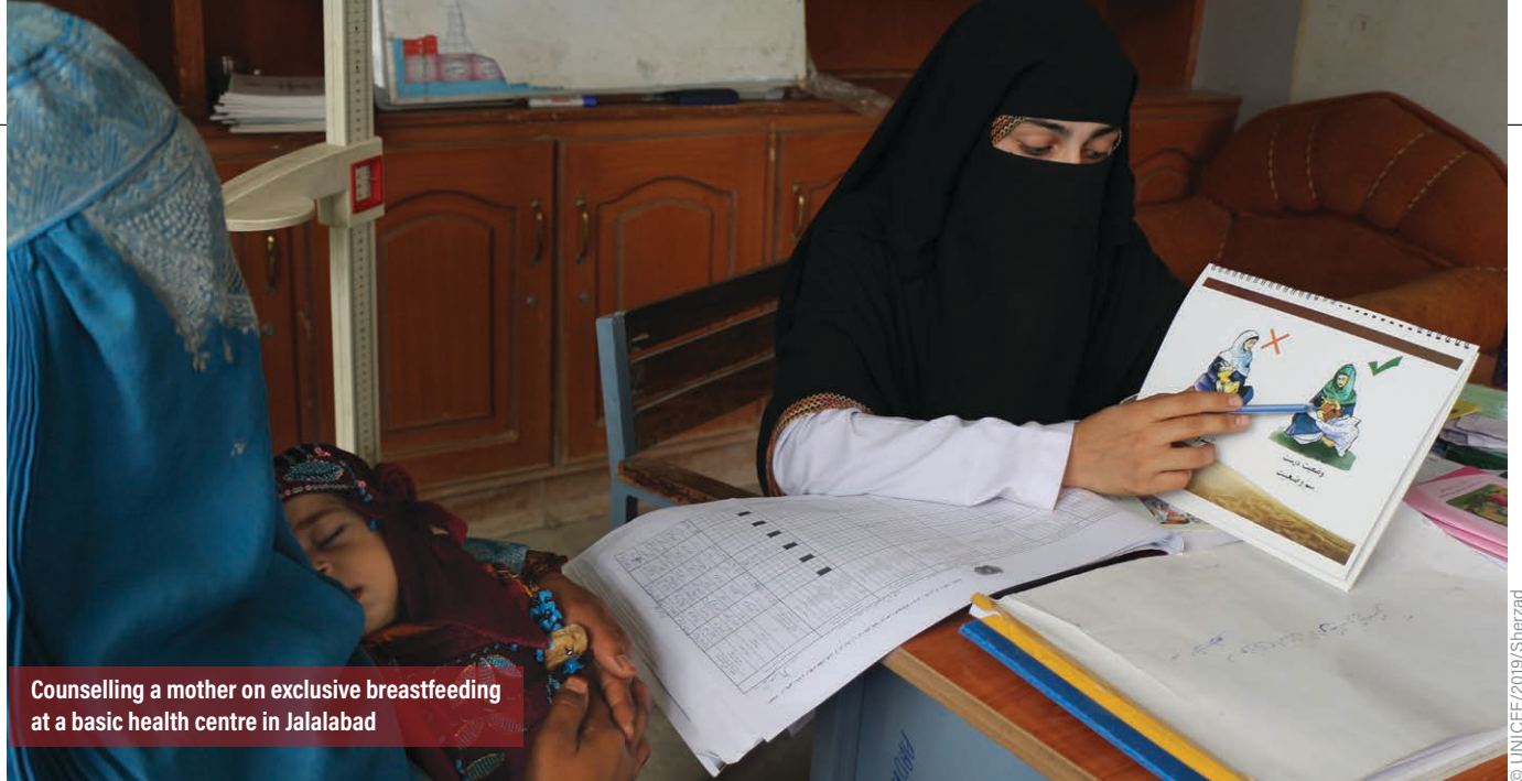
Counselling a mother on exclusive breastfeeding at a basic health centre in Jalalabad